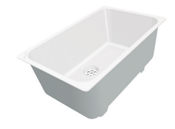
CUVETTE PLASTIQUE BLANCHE

A154 F00 * only in combination with the accessory A644 F04