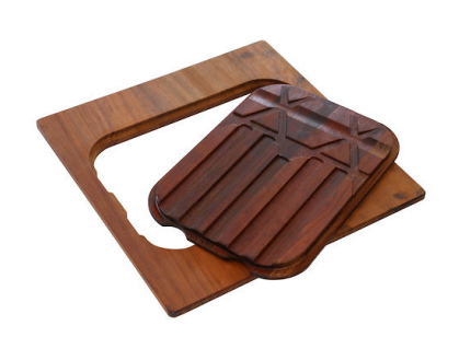
PLANCHE DE DECOUPE DOUBLE IROKO